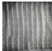
Ten Years and Eighty-Seven Days, 2016