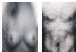
Ten Years and Eighty-Seven Days, 2016

Copyright © 2013-2017 Textile is more! ● Copyright, privacy, disclaimer ● Advertising